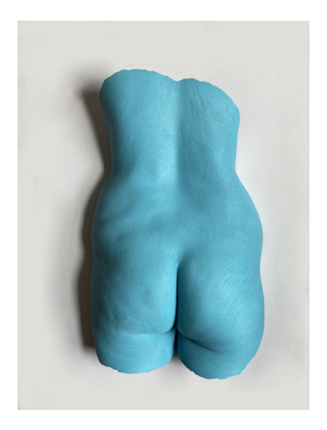
• Keera in Blue, resin 2023 • 21 x 16 x 6 in