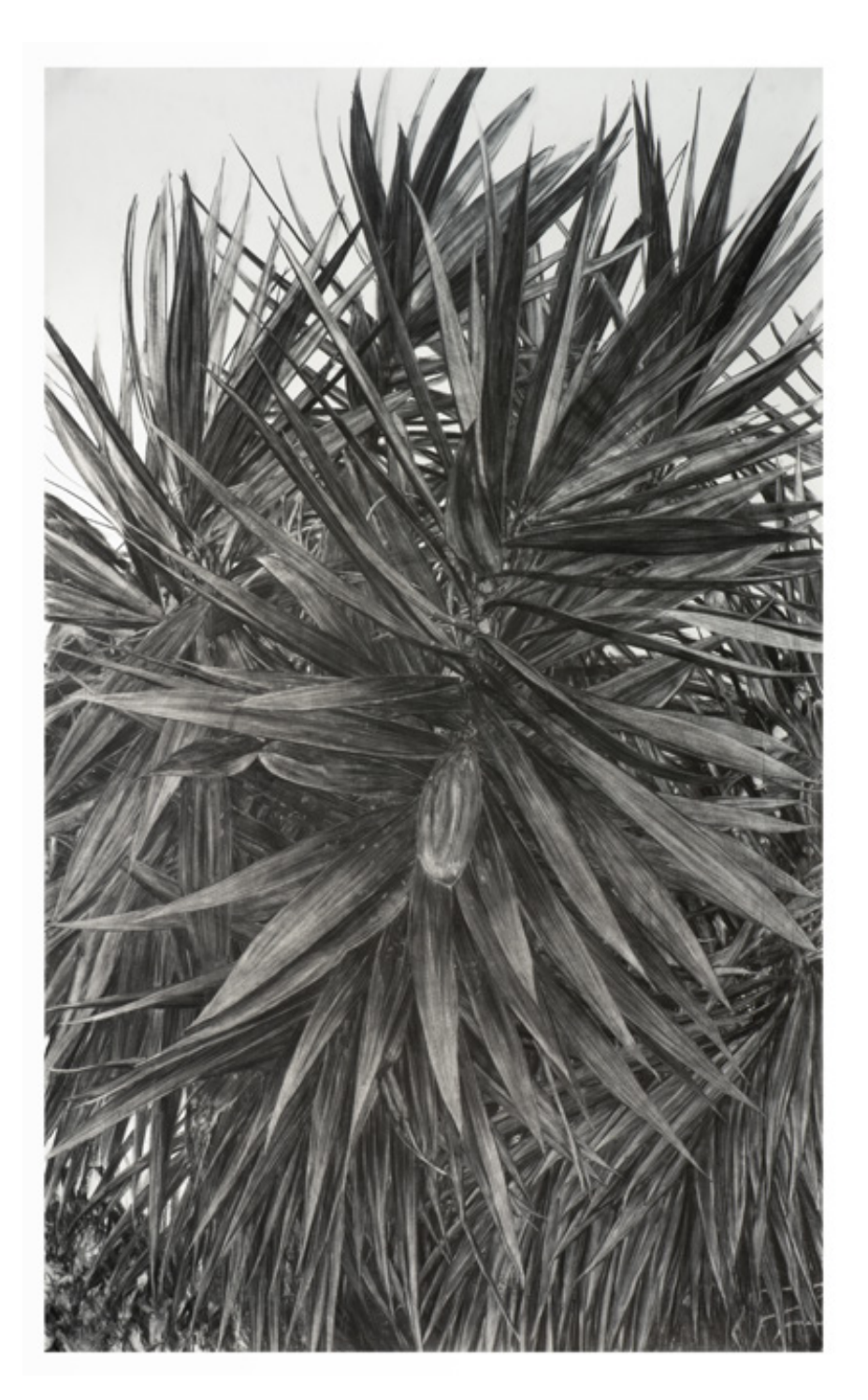
• ATC SERIES #15 • CHARCOAL DRAWING ON PAPER • 76 X 46 I