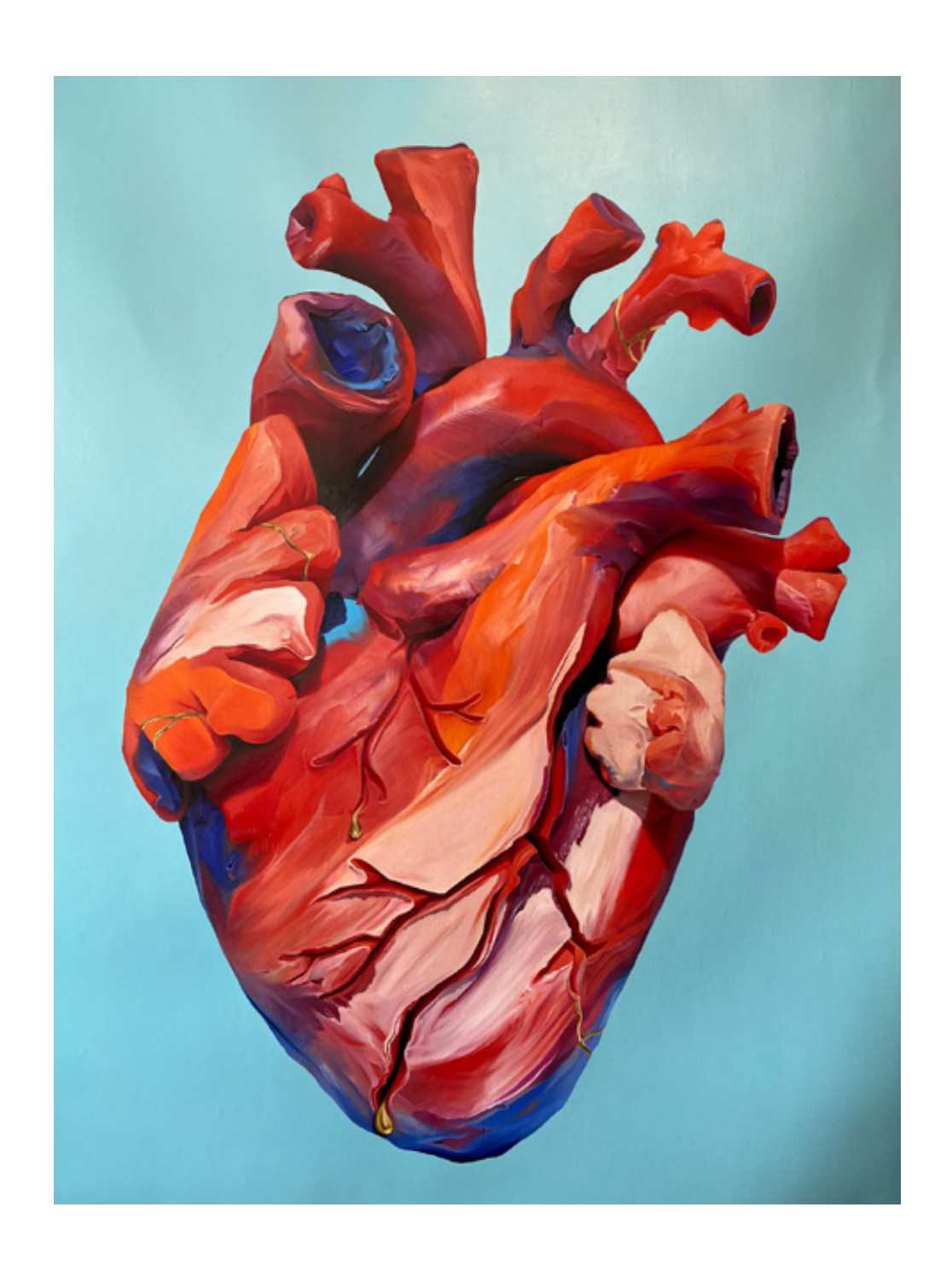
• Kintsugi , oil on canvas 2022 • 54 x 38 in