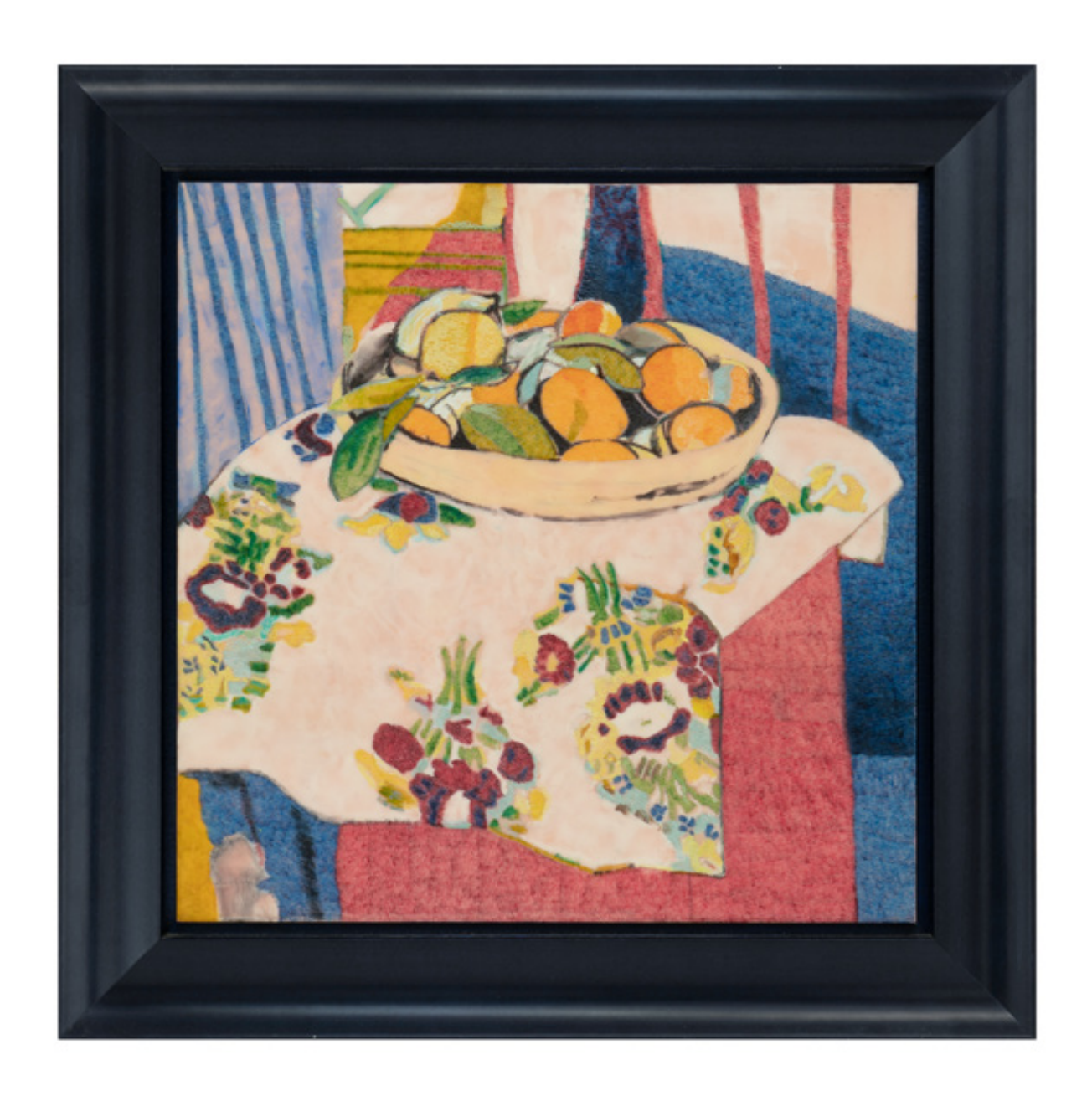
Still Life \,^{\circ} photograph and layered tattooed drawing on encaustic \,^{\circ} 19 1/2 x 19 1/2 in