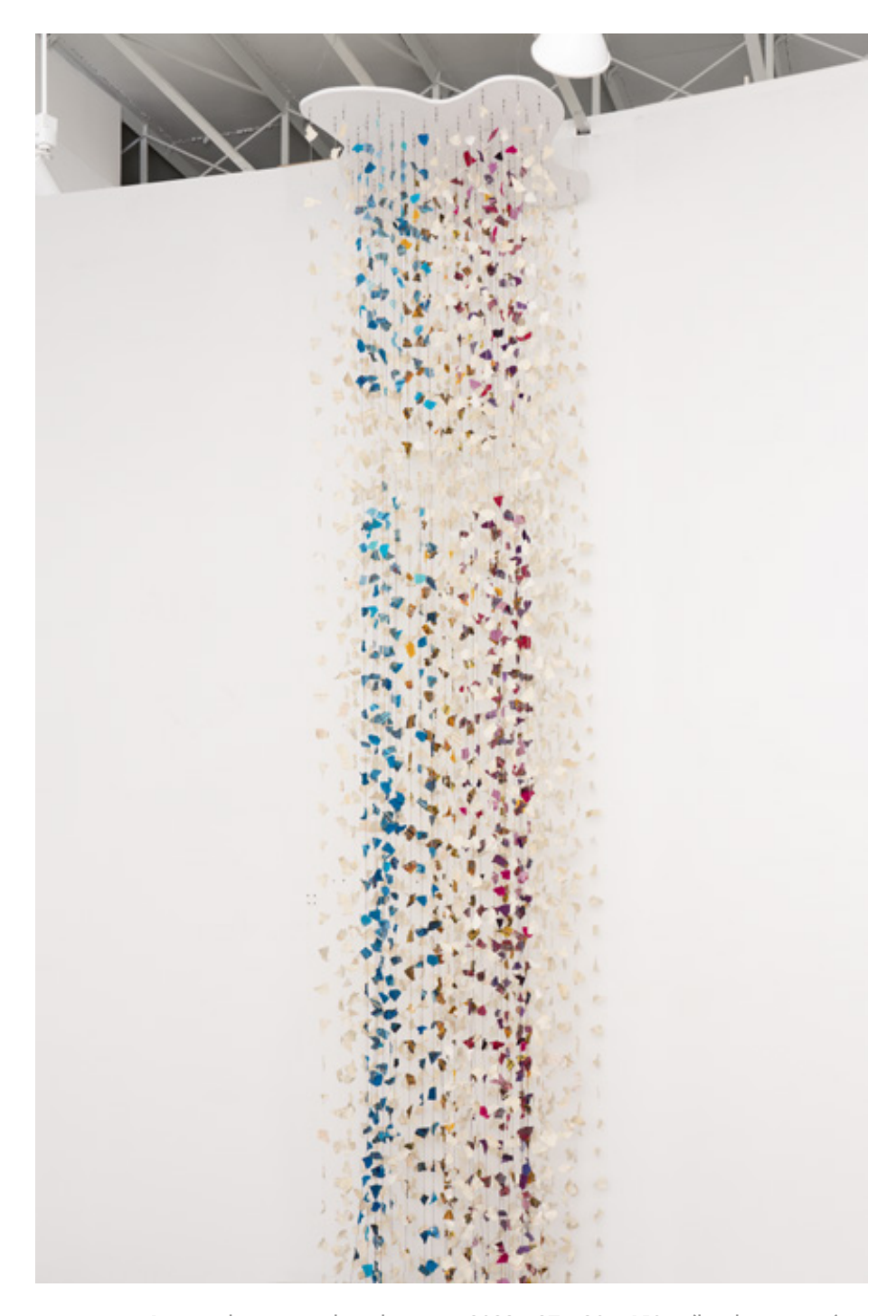
\bullet Raining down, aereal textile mosaic 2023 \bullet 37 x 30 x 150 in (height can vary)