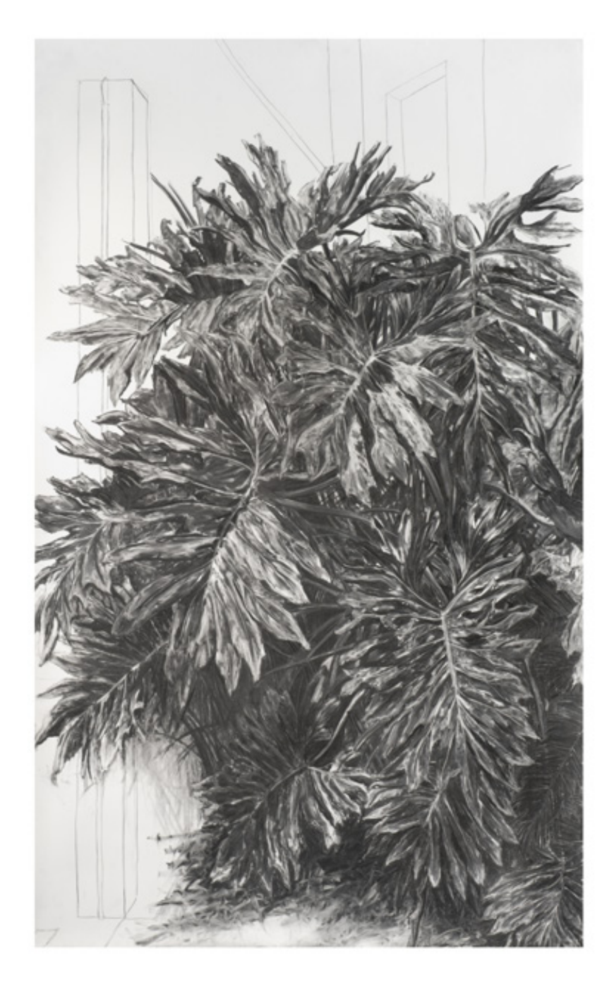
•ATC SERIES # 6 • CHARCOAL DRAWING ON PAPER • 76 X 46 in