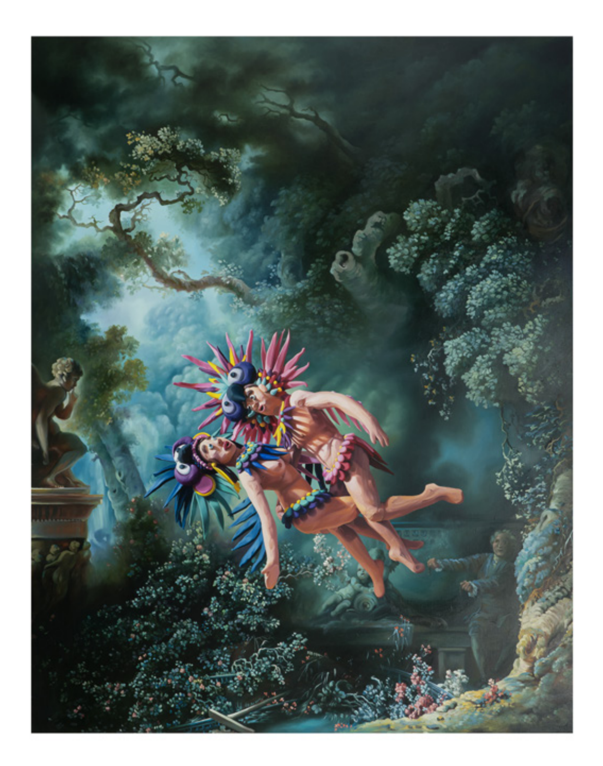
{\rm \circ \, Romantic \, Love} , oil on canvas 2023 {\rm \circ \, \, 70 \, \, x \, \, 50} in